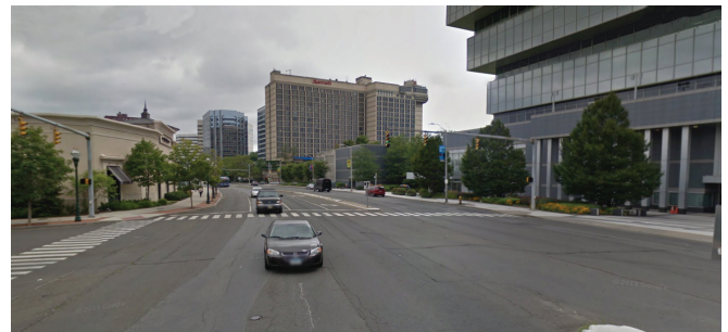
Image: US Route 1 in Stamford. US Route 1 is a typical arterial road: a wide, multi-lane road which enables speeds of 40 mph or higher, and with little to no pedestrian and bicycle infrastructure.

US Route 1 topped the charts with 169 pedestrian crashes, 152 of which resulted in injuries; 7 of which were fatal (10 of which resulted in property damage with no injuries or fatalities).