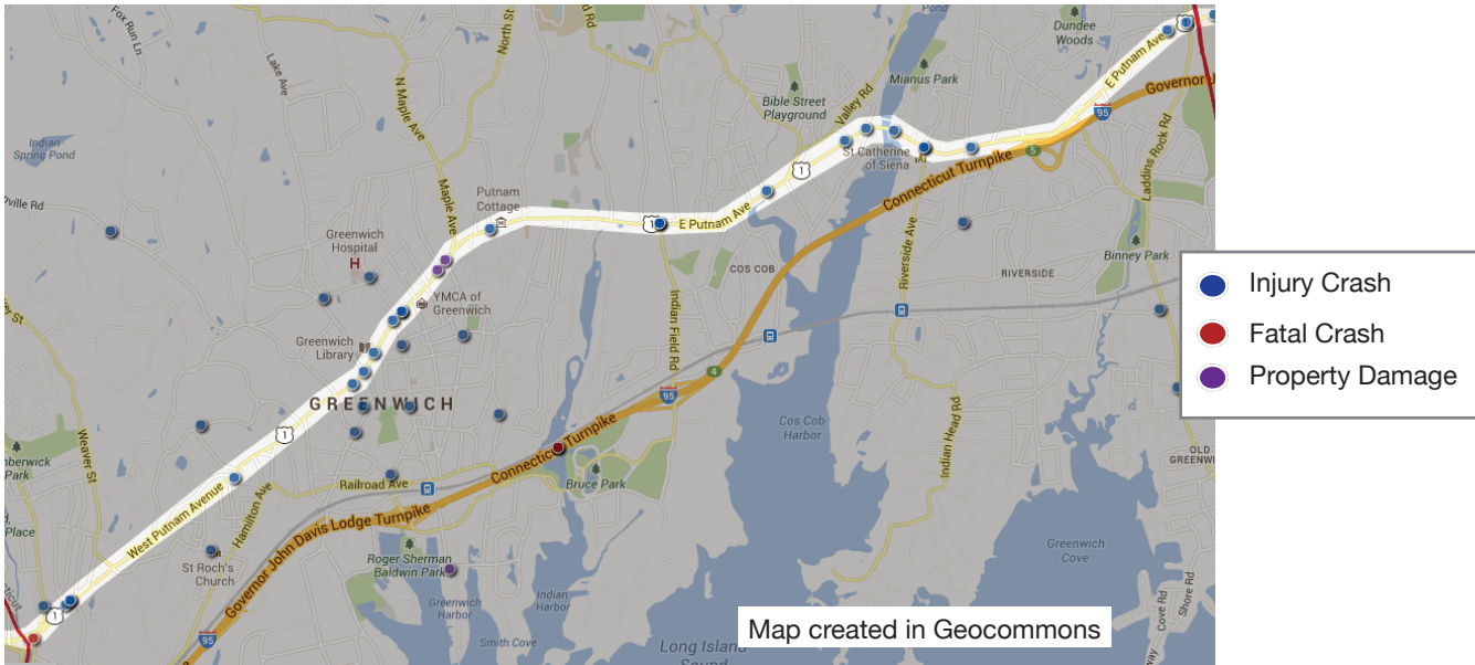
Photo: US Route 1/ West Putnam Ave/ East Putnam Ave in Greenwich.

In the three years from 2010 through 2012, there were 169 pedestrian crashes along US Route 1, making it the most dangerous road for pedestrians in Fairfield County.