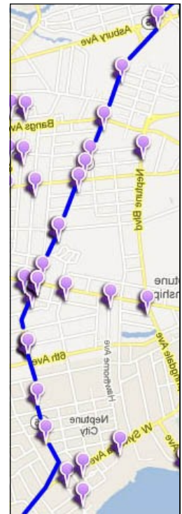
Snapshot of NJ-35. NJ-35 is approximately 25 miles long within Monmouth County.